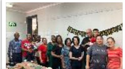
STUDENT LIFE & CELEBRATIONS

DBC's emphasis is not only on the head and the hands, but also on the heart - a heart for the lost and a heart that displays the fruit of the Spirit. Students at DBC are encouraged to work with others, participate in the chapel and devotions, exercise humility, and seek counsel to grow. (Gal. 5:22-23)