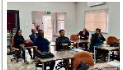
CHAPEL & DEVOTION

At DBC, both facilitators (lecturers) and students are firmly grounded in the Word of God, thus learning how to handle Scripture correctly. This is considered the primary task for everyone who is called to full-time ministry including lay workers who assist in the church. This is necessary for the spiritual growth of every Christian. (2 Tim. 2:15)