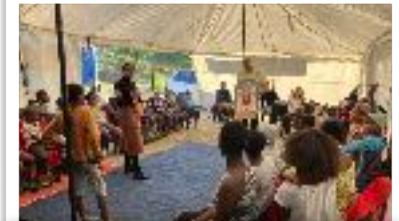
MISSION TRIP & OUTREACH

The knowledge of God equips the saints for Christian service – for God and for others. This ensures that the Word of God is put into practice. As such, students at DBC will engage in practical ministry both and in the local church, and on an organised mission trip. (2 Tim. 3:16-17)